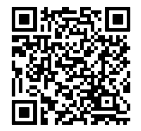
/ Submit your design here.