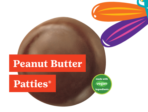
Crispy cookies layered with peanut butter and covered with a chocolaty coating