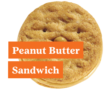
Crisp and crunchy oatmeal cookies with creamy peanut butter filling