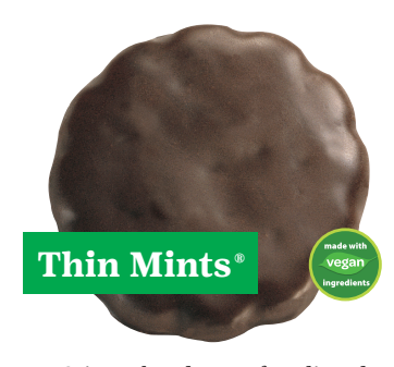
Crispy chocolate wafers dipped in a mint chocolaty coating