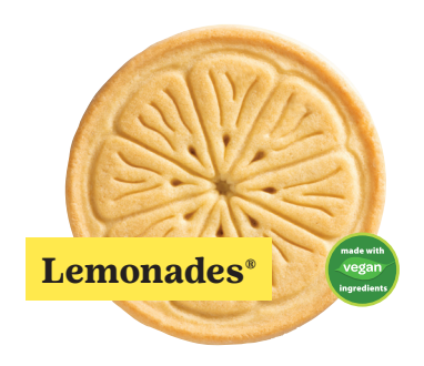
Savory slices of shortbread with a refreshingly tangy lemon flavored icing