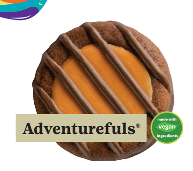
Indulgent brownie-inspired cookies with caramel flavored crème and a hint of sea salt