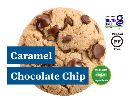
Caramel, semi-sweet chocolate chips, and a hint of sea salt in a delicious cookie* *Limited availability