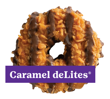
Crispy cookies topped with caramel, toasted coconut, and chocolaty stripes