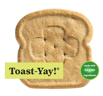
French Toast-inspired cookies dipped in delicious icing