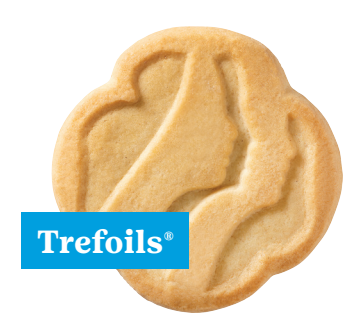
Iconic shortbread cookies inspired by the original Girl Scout recipe