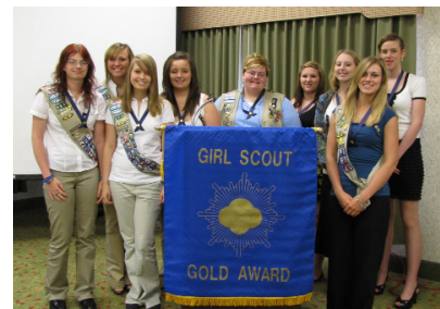
Pictured: nine of the Girl Scout Gold Awardees at the Young Women of Distinction event on April 17.

Congratulations to the thirty-four girls who have earned the Girl Scout Gold Award this year! "Girl Scouts of the Missouri Heartland is thrilled to celebrate the accomplishments of these young women,"