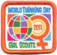
Patch available at all shops.