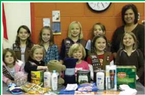
Girl Scout Brownie Troop 70485 with its donation to the South-west Missouri Office on Aging.