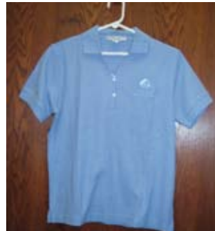
NEW STYLE! Ladies' polo shirt.