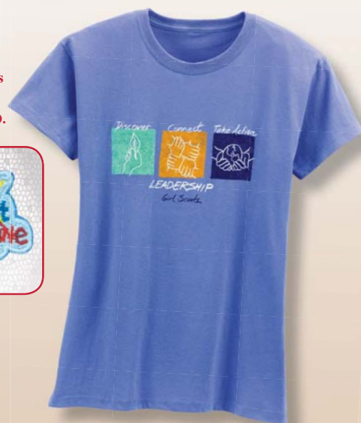
Girl Scout Leadership T-Shirt. Cotton jersey with banded crew neck. Traditional fit. Imported. Misses Sizes: S-M-L-XL. 8876. $23.00. Women's Sizes: 2X-3X. 8876. $26.00.