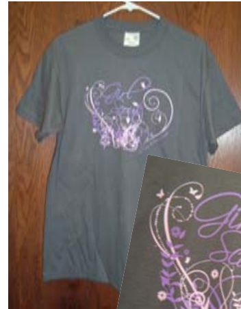
Girl Scouts tee (Adult)