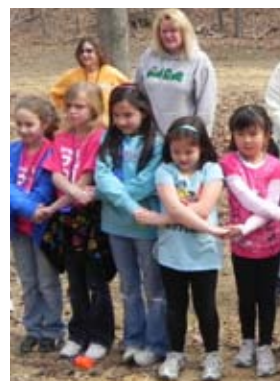
Pictured, above: Knot-tying at the Finbrooke Program Center; Left: Friendship Circle at the Sacajawea-East Program Center.

Saturday, March 20. The events, held at the Finbrooke and Sacajawea - East Program Centers, featured stations such as First Aid, Girl Scout traditions, camp songs, S'mores and more!