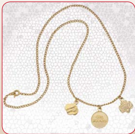
NEW! Three Charm Necklace. This stylish necklace features a solid trefoil shaped charm (½") contemporary service mark charm (½") and "Girl Scouts" charm (¾") with round jewelry clasp closure. 20" goldtone chain. Imported. 12049. $12.00.