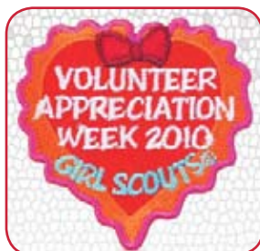
NEW! Iron-On Volunteer Appreciation Week 2010 Patch. 2½" x 2¼". 58024. $2.00.