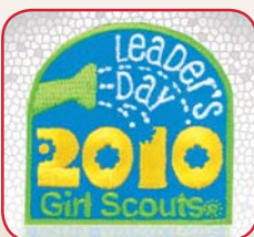
NEW! Sew-On Leader's Day 2010 Patch. 1¼" x 1¼". 18948. $1.50.