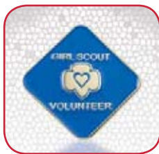
NEW! Volunteer Lapel Pin. Navy, brass plated pin with "Girl Scout Volunteer" gold plated imprint. Clutch back. Imported. ⅝" x ⅝". 11378. $3.75.

Join in this fun week long celebration of Volunteers. Show your appreciation to everyone who gives unselfishly of their time on behalf of Girl Scouting. And remember...Girl Scout Leaders' special day is April 22nd.