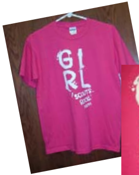
Girl Scouts Rock tee (Adult & Youth sizes)