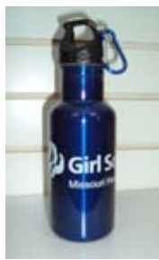
Water bottle holder & water bottle