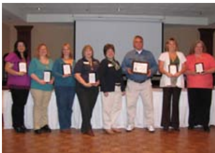
Pictured: Volunteers receiving council awards at the GSMH Annual Meeting

National Volunteer Appreciation Week is April 18-24.