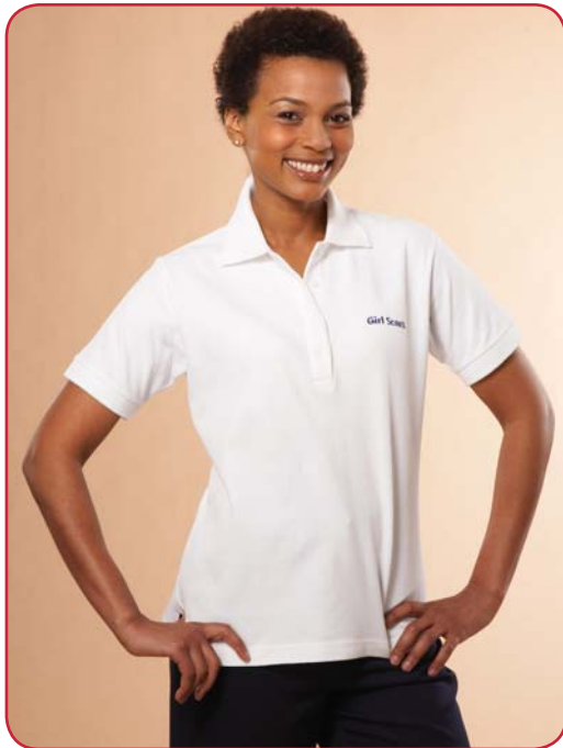
Adult Polo Shirt. Comfortable, casual shirt has ribbed collar and cuffs, button placket and side vents. Cotton/spandex pique knit. Slightly shaped style. Imported. Misses Sizes: S-M-L-XL. 8861. $30.00. Women's Sizes: 1X-2X-3X-4X-5X. 8862. $35.00.