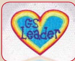
NEW! Girl Scout Leader Embroidered Pin. 1½" x 1". Imported. 11345. $1.25.