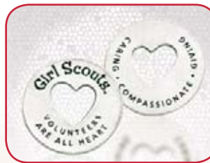
NEW! Volunteer Pocket Token. Perfect keepsake that can be carried in a purse, pocket or worn on a chain. Heart center cut-out. Imprinted on one side with "Girl Scouts Volunteers Are All Heart" and on the other side with "Caring, Compassionate, Giving". 1" round. Pewter. Made in USA. 24669. $2.00.