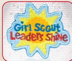
NEW! Girl Scout Leaders Shine Embroidered Pin. 1¼" x 1¼". Imported. 11344. $1.25.