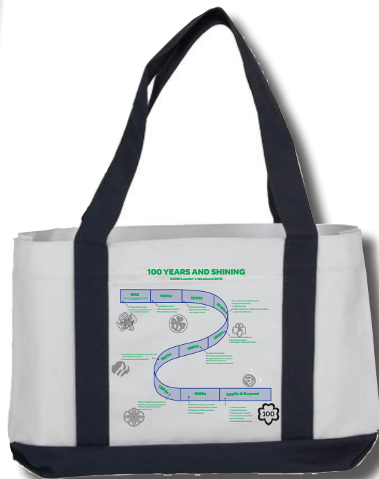
Tote Bag $8.50

Items pictured are mock-ups; final design and colors may vary slightly.