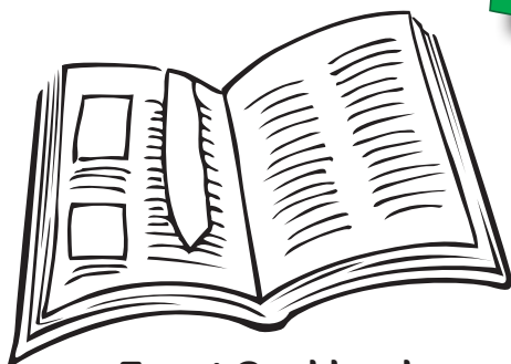
Event Cookbook (compilation of various locations/years) $5.00