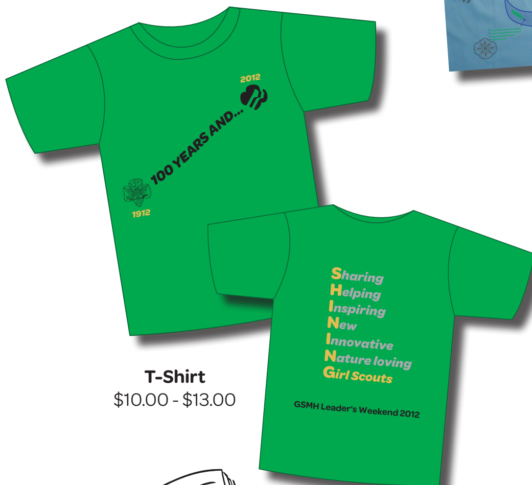
T-Shirt $10.00 - $13.00

Available only to event participants! Order your items on the Leader's Weekend Event Registration Form by March 9, 2012!