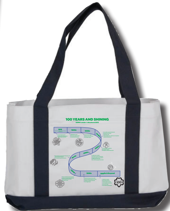
Tote Bag $8.50

Items pictured are mock-ups; final design and colors may vary slightly.