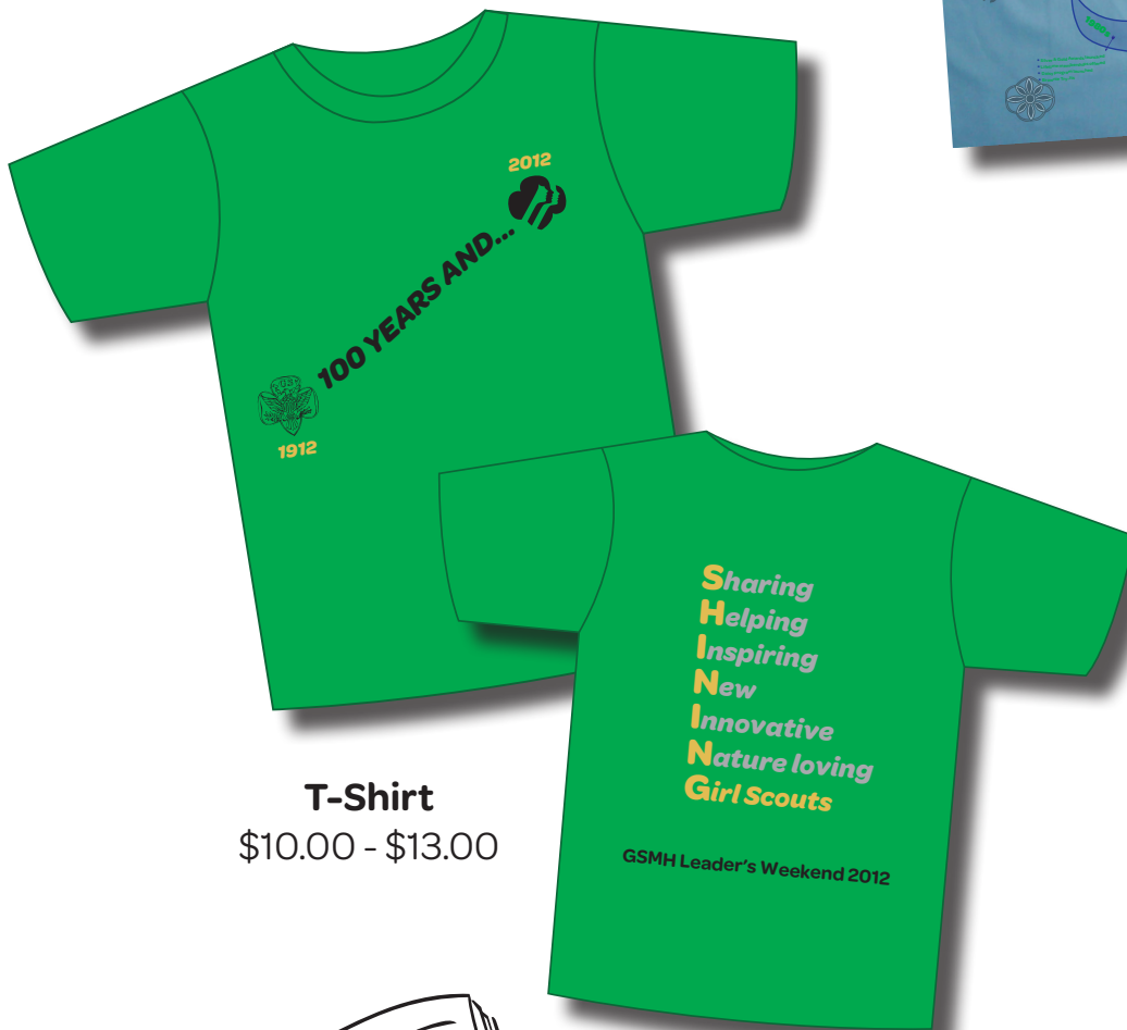
T-Shirt $10.00 - $13.00

Available only to event participants! Order your items on the Leader's Weekend Event Registration Form by March 9, 2012!