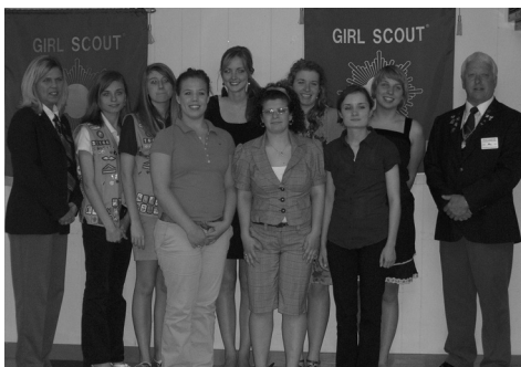
All That Glitters Receptions, from top: Springfield, Cape Girardeau, Jefferson City