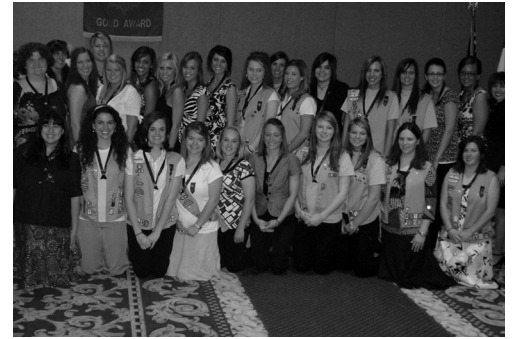
Young Women of Distinction, Columbia

Girl Scouts of the Missouri Heartland was excited and honored to have thirty-eight girls earn the Girl Scout Gold Award this year. As the highest award in Girl Scouting, the Girl Scout Gold Award is a culmination of a girl's leadership experience in Girl Scouting. Of the eligible teenage Girl Scouts in the entire United States last year, only 5.4% completed a Girl Scout Gold Award project. Award completion requirements include seven steps and at least sixty-five hours of research, preparation, leadership, service, and evaluation. Each girl must identify a need in her community, locally or globally, and initiate a project that creates positive change and a lasting impact. The project is more than just community service; it encompasses organizational, leadership, and networking skills that girls will carry with them as they begin their college or career path.